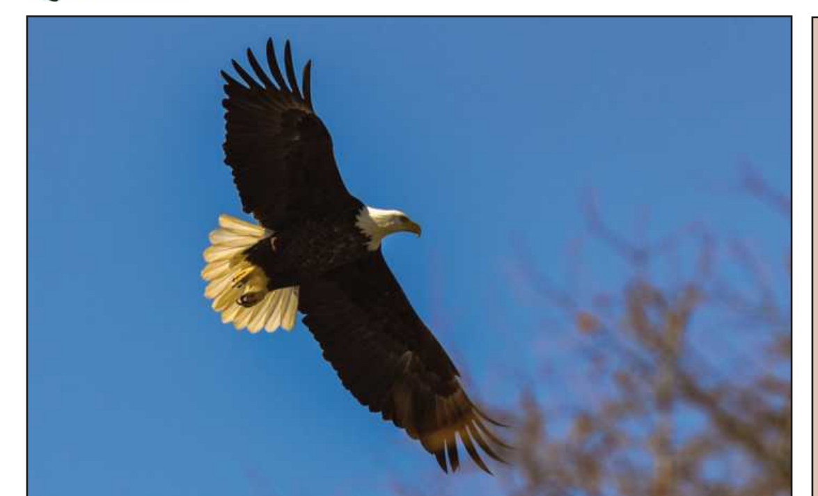
A BALD EAGLE in flight in Michigan.