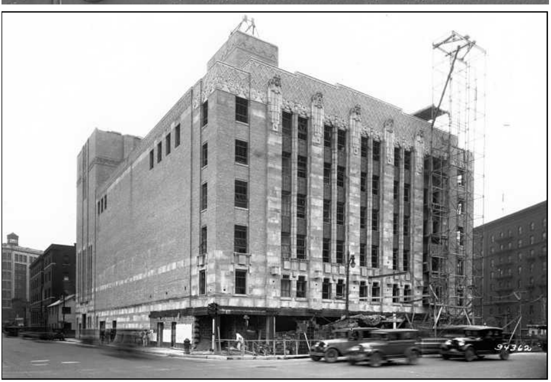
DETROIT'S MUSIC HALL THEATER is shown under construction in 1928. Typical for theater architecture at the time, the hall, then the Wilson Theater, was built with rich ornamentation and was, and is, an excellent place to see a show. "At 1,731 seats, Music Hall is intimate, with excellent acoustics and nearly perfect sight lines. No seat is more than 70 feet from the stage," says The Vendry, a database for site vendors.

Next to New York City, Detroit (very arguably) has the second-largest number of theater seats in its downtown, although cities like Chicago, Cleveland and Houston claim that distinction, too.