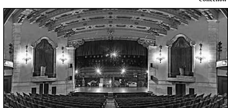
THE INTERIOR of the Music Hall Center for the Performing Arts. The venue's architect borrowed design ideas from European theaters, and it was made adaptible for both stage shows and motion pictures.

"The lovely, light exterior of the Art Deco theater is faced with pale yellowish-brown Mankato stone and orange-tan brick; trimmed with cream, orange, and green terra-cotta mosaics; and embellished with masks of Tragedy and Comedy and other drama symbols in terra-cotta by Corrado Joseph Parducci," she wrote. "The ticket lobby leads to the main lobby and from there either