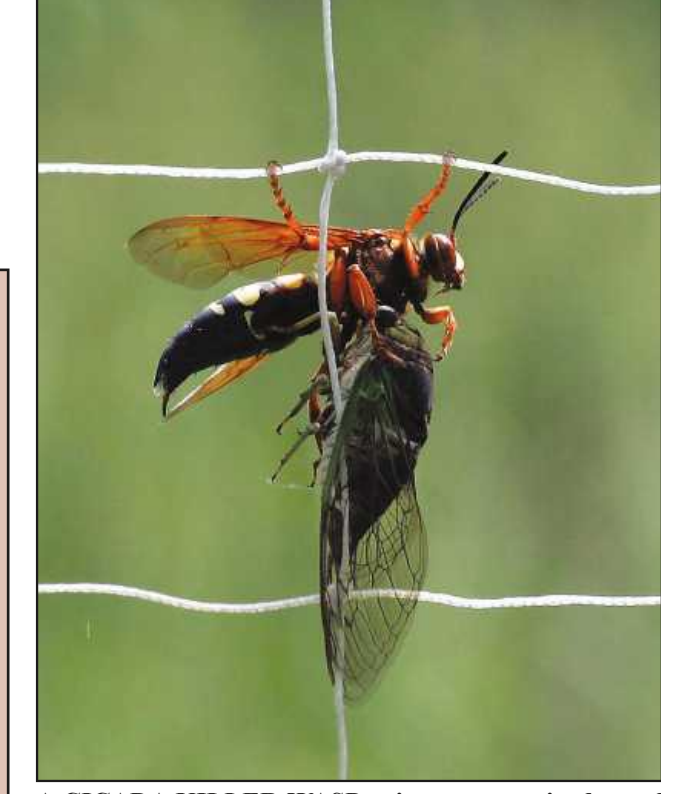
A CICADA KILLER WASP enjoys a tasty cicada, and will usually leave humans alone if you don't bother them.

·Visitors in areas without designated swim beaches should use extreme caution because they will not have the benefit of the beach flag warning system or the visual cautions of buoys that mark water depth and obstacles.