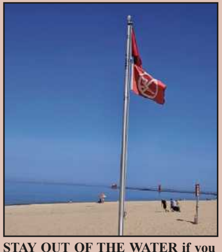
STAY OUT OF THE WATER if you see two red flags on a Michigan beach.

"You can help bald eagles succeed in Michigan by keeping a safe distance from nests and avoiding certain activities that could disturb them," said Chris Mensing, a U.S. Fish and Wildlife Service biologist based out of Lansing. "When outdoors, take a moment to clean up trash, safely dispose of old fishing line and lures, and avoid using lead shot and lead tackle."