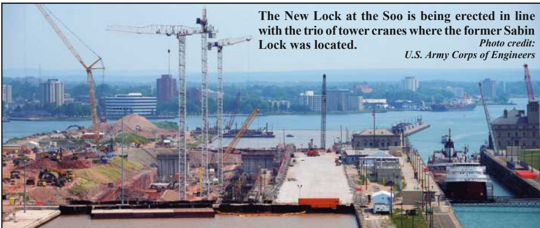
The New Lock at the Soo is being erected in line with the trio of tower cranes where the former Sabin Lock was located.