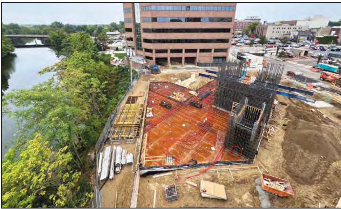
RISING BETWEEN the Grand River and Grand Avenue is the 28-story Tower on Grand, part of the most significant development in downtown Lansing in decades. The tower is being erected just north of the State of Michigan's Health and Human Service Building.

Plasterers and Cement Masons: It is your responsibility to fill out reciprocity forms if you plan on working out of the local 514 area. This will ensure that your hours are sent back to your home fund. If you have any questions, or need any forms,